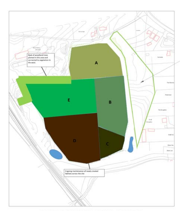
RESTORATION SECTIONS A B C D E