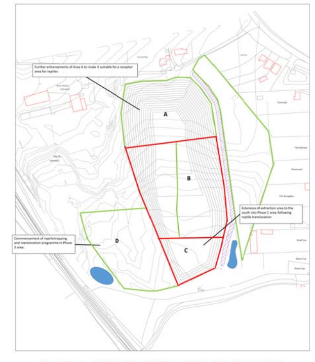
PHASE 2 - FURTHER EXTRACTION SOUTHWARDS