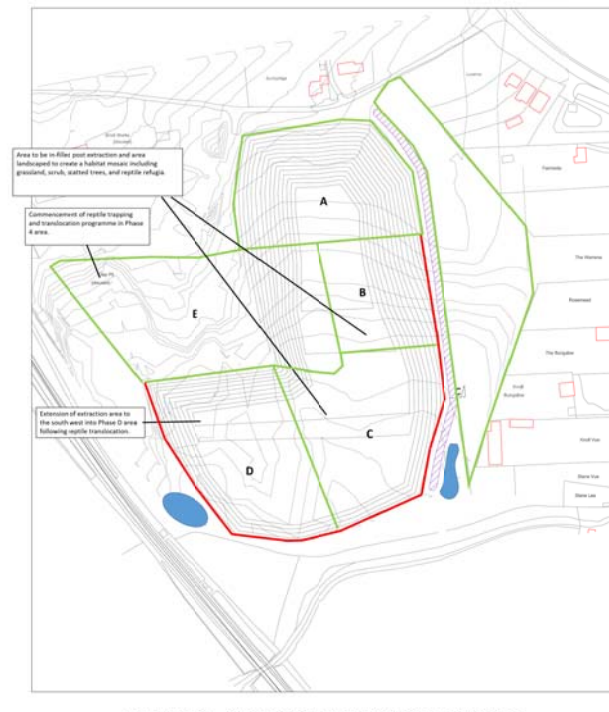
PHASE 3 - WIDENING QUARRY TO WEST